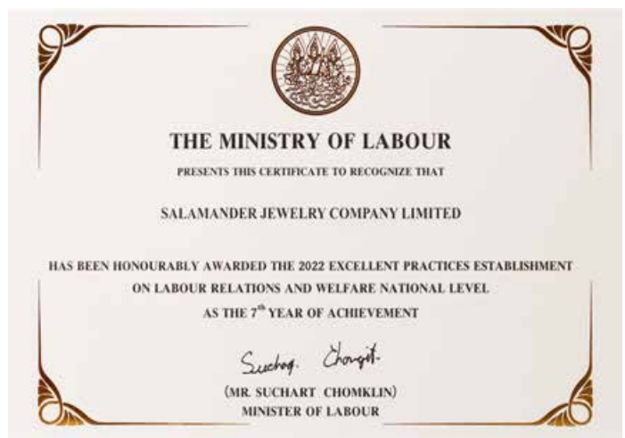
Honorably award 2022 on Labor relations and Welfare