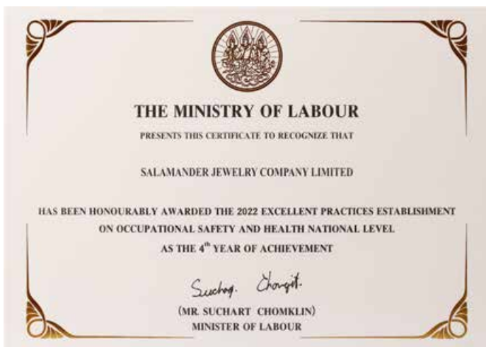
Honorably award 2022 on Occupational safety and Health