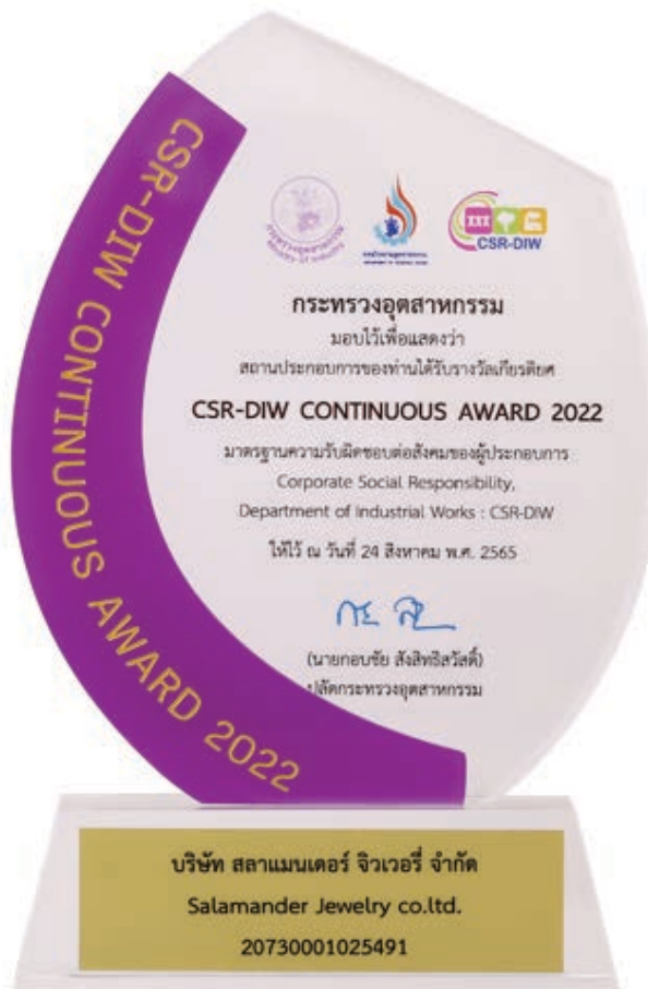
CSR-DIW CONTINUOUS AWARD 2022